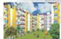
MEENA RESIDENCY 1