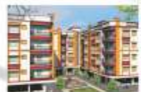
MEENA RESIDENCY 2